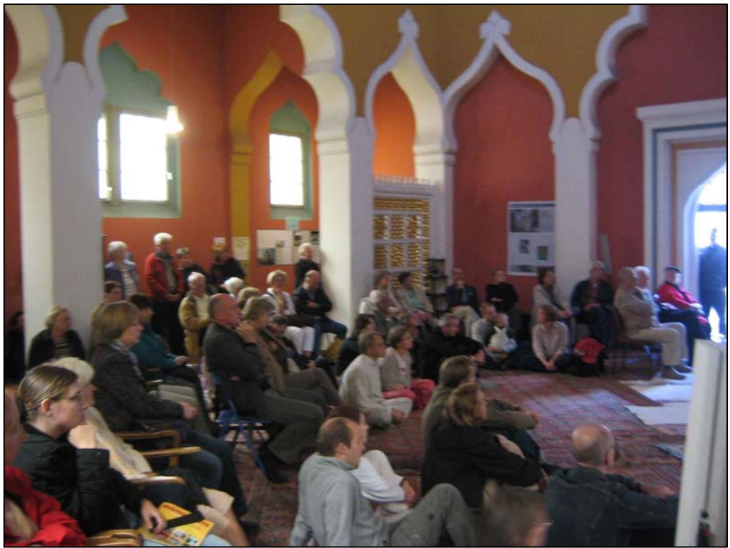
A view of the audience