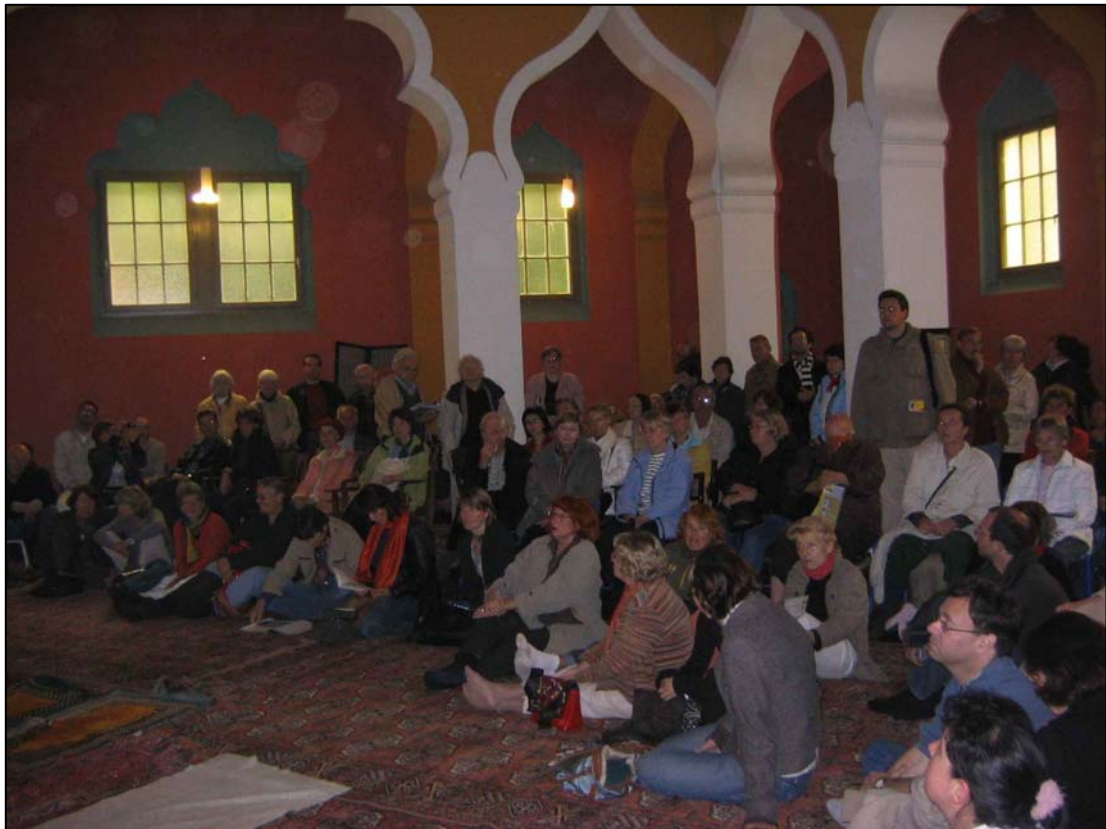
A view of the audience