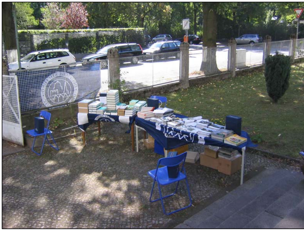
The stalls of books which contained our books and DSD brochures