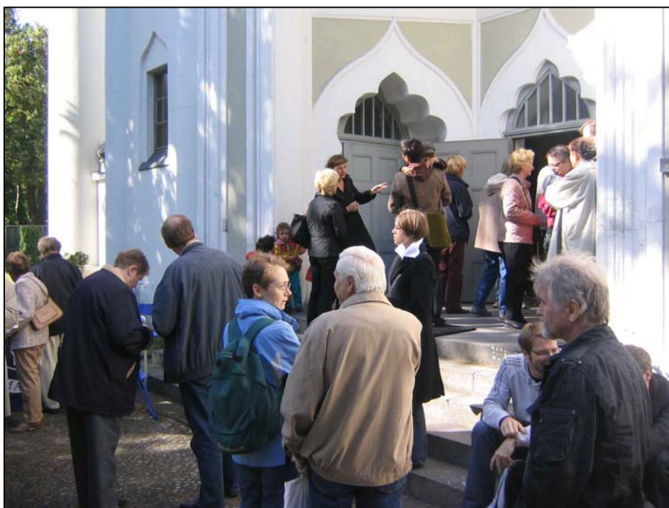
People waiting outside the mosque before opening ceremony